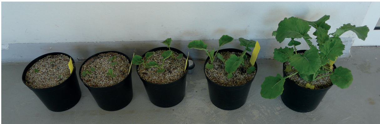
Figure 1. Growth stages of oilseed rape at spraying (experiment 1). From left to right: BBCH 10, BBCH 11.5, BBCH 12, BBCH 13.5 and BBCH 14.

The growth stages of oilseed rape varied from BBCH 10 (cotyledon stage) to BBCH 14 (4 leaf stage) at spraying (experiments 1 and 2) while the growth stages of black bindweed in experiment 3 varied from BBCH 10 to BBCH 12 (2 leaf stage) at spraying. Photos of the weeds prior to spraying are shown in Figures 1 and 2.