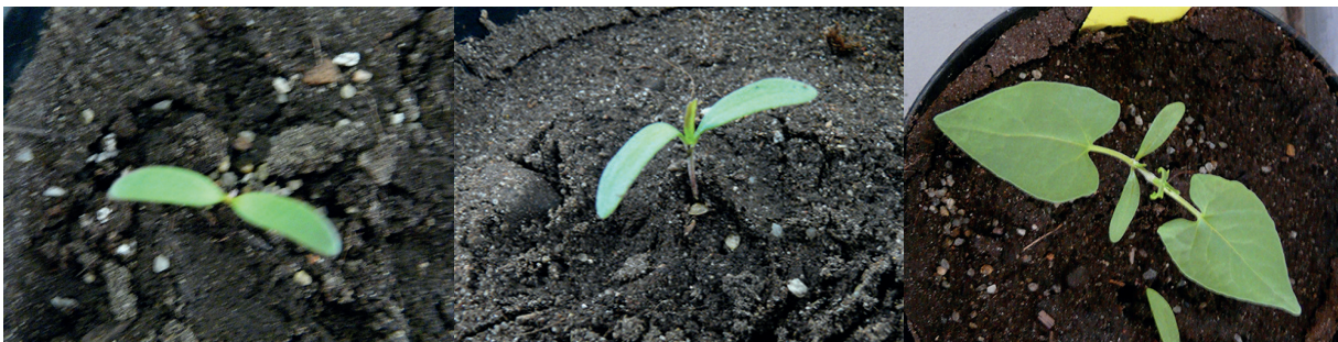
Figure 2. Growth stages of black bindweed at spraying (experiment 3). From left to right: BBCH 10, BBCH 10.3 and BBCH 12-13.